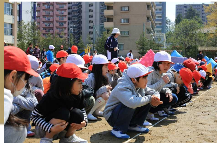
DRR education at elementary school