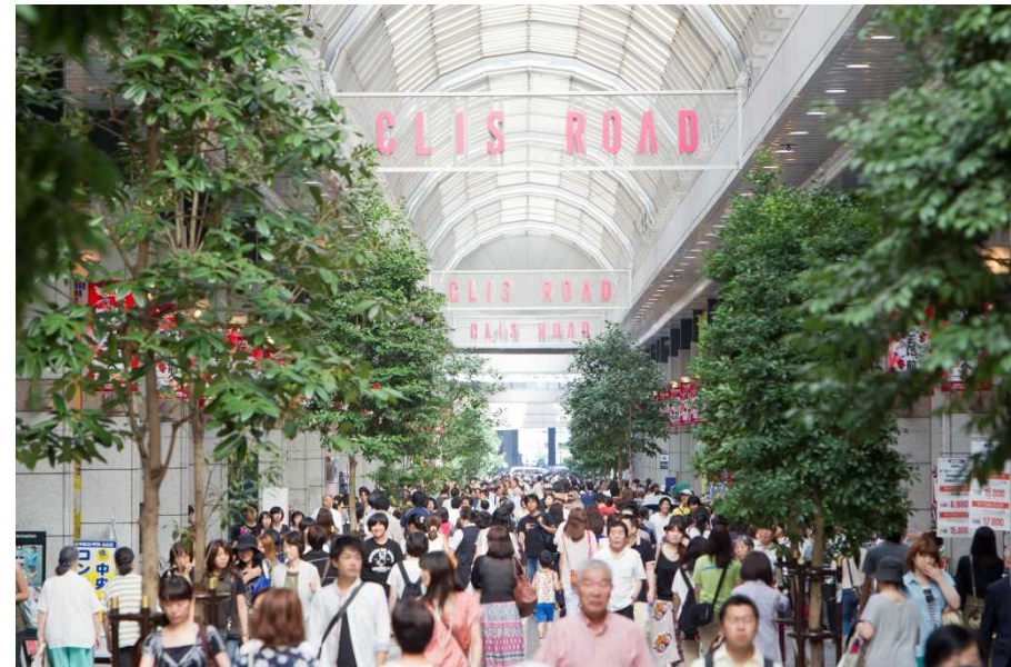
Main street of downtown Sendai