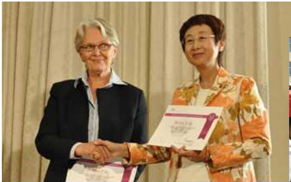
Ms. Margareta Wahlström, UN Special Representative of the Secretary-General, presents a certificate to Sendai City.(October 9,2012)