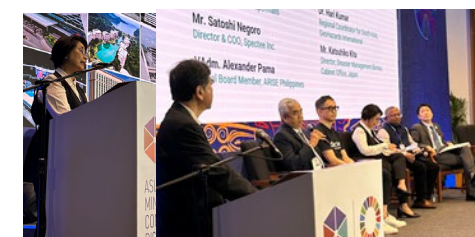
Public-Private Seminar for the Asia-Pacific Countries in Manila (Oct, 2024)