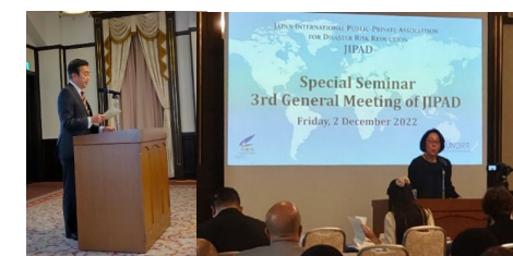
The JIPAD 3rd General Meeting (Dec, 2022)