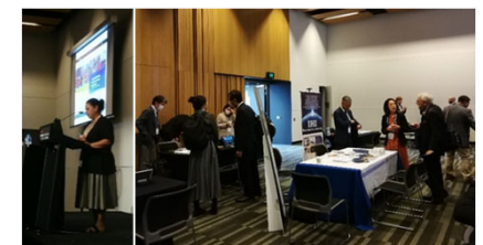
Public-Private Seminar on Innovative DRR Policies and Technologies for the Asia-Pacific Countries in Brisbane (Sept., 2022)