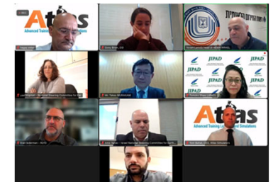
Japan-Israel Public-Private Seminar for DRR (Mar., 2022)