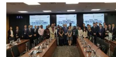
Japan-Africa Public-Private DRR Seminar in Tokyo (Oct, 2019)

Organize information on disaster prevention technologies and know-how of member companies/organizations - 49 companies/organizations (118 solutions)