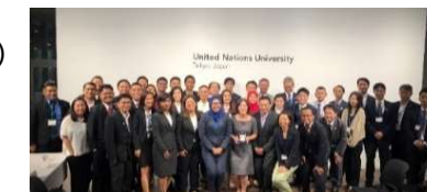
Japan-ASEAN Public-Private DRR Seminar in Tokyo (Oct, 2019)