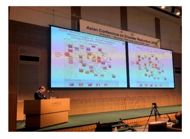
Asian Conference on Disaster Reduction

The ADRC convenes the Asian Conference on Disaster Reduction (ACDR) jointly by the Cabinet Office every year and invited persons in charge of disaster risk management from member countries and international organizations to share information on disaster risk management and mitigation, exchange opinions and strengthen collaboration in Asia, which is prone to frequent disasters. Celebrating the 20th anniversary of the ADRC, the 14th round of the ACDR was held on Awaji Island, Hyogo Prefecture from October 30 to November 1, 2018, based on the themes of "cross-border collaboration to tackle disasters" and "enhancement of a global disaster database." More than 110 people attended the conference from member countries (25 out of 31 countries) and international organizations such as the ASEAN Coordinating Centre for Humanitarian Assistance on Disaster Management (AHA Centre) and JICA. Disaster management representatives shared information on strategies and systems for reducing the disaster risk in individual countries as well as the progress of initiatives concerning SFDRR.