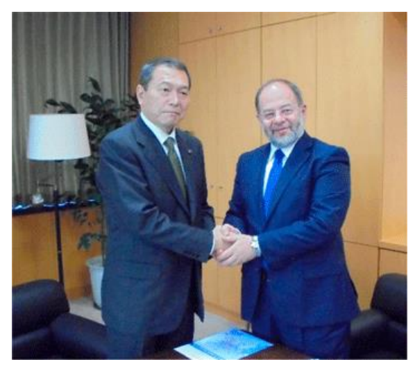
H.E. Mr. OKONOGI, Minister of State for Disaster Management, and H.E. Mr. Akdag, Deputy Prime Minister of the Republic of Turkey