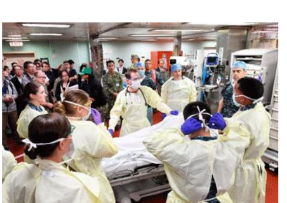
On-board surgical operation