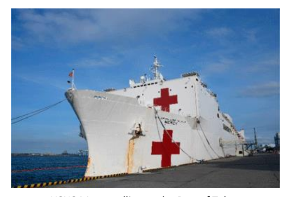
USNS Mercy calling at the Port of Tokyo

The above seminar and symposium were a great learning experience for Japanese participants working in the disaster medicine and disaster management as they could directly see the scale of Mercy as a hospital, the rich medical human resources, the patient transportation process, the clearly defined instruction order structure for ship operation and medical activities, the relief supplies procurement process, and other various know-how specific to hospital ships.