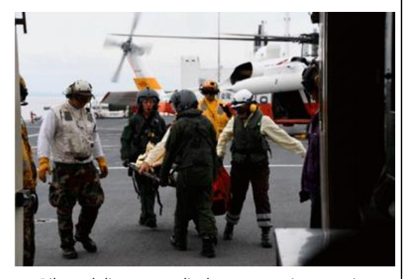
Bilateral disaster medical transportation exercise