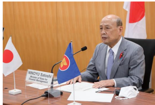
Minister of State for Disaster Management NINOYU, speaking at the First ASEAN-Japan Ministerial Meeting on Disaster Management