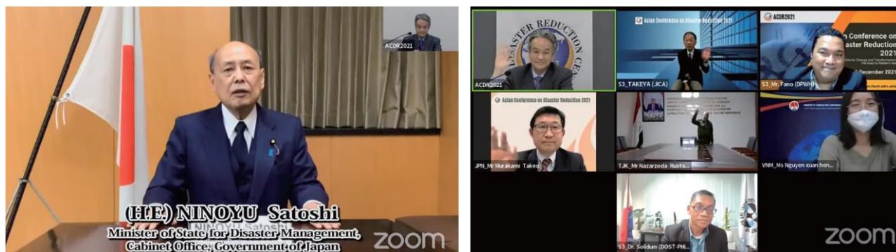
Asian Conference on Disaster Reduction

As a pre-event of the conference, five thematic seminars were held from June to October 2021. In addition, on December 15, 2021, the Cabinet Office and the ADRC hosted a public-private seminar for disaster risk reduction, presented by "Japan International Public-Private Association for Disaster Risk Reduction (JIPAD)" as side event. The seminar was attended by about 70 participants from the attendance of the Asian Conference on Disaster Reduction and JIPAD member organizations. Twelve Japanese private-sector companies gave presentations on their disaster risk reduction technologies.