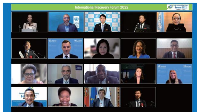
International Recovery Forum 2022